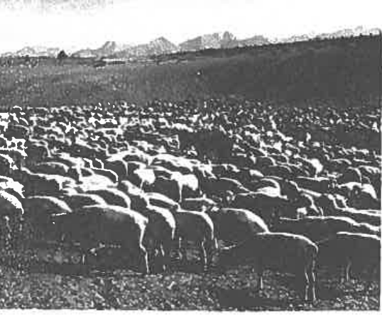
1968-1970 The National Museum of American Art Washington, D.C. Gift of The Johnson Foundation